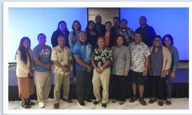
Following the Strategic Plan Workshop, OPA consulted with various External Stakeholders to discover what they expect OPA to achieve and how they can support us in achieving those expectations at West Plaza Hotel at Lebuu Street. (July 2023)